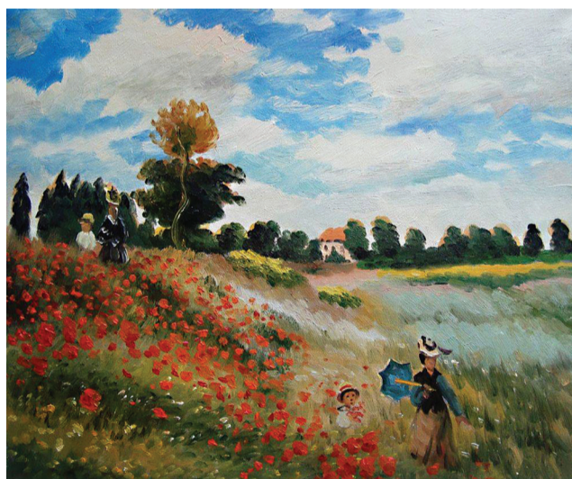
The Poppy Field near Argenteuil, 1873 by Claude Monet