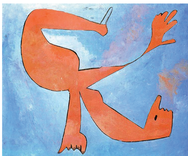
The Swimmer, 1929 by Pablo Picasso