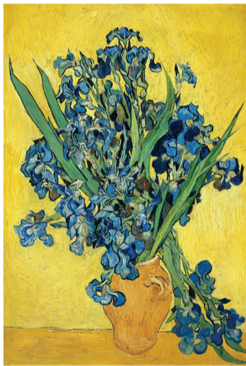
Vase with Irises Against a Yellow Background, 1890 by Vincent Van Gogh

Complementary colour relationships are used by artists to create both harmony and energy in their work.